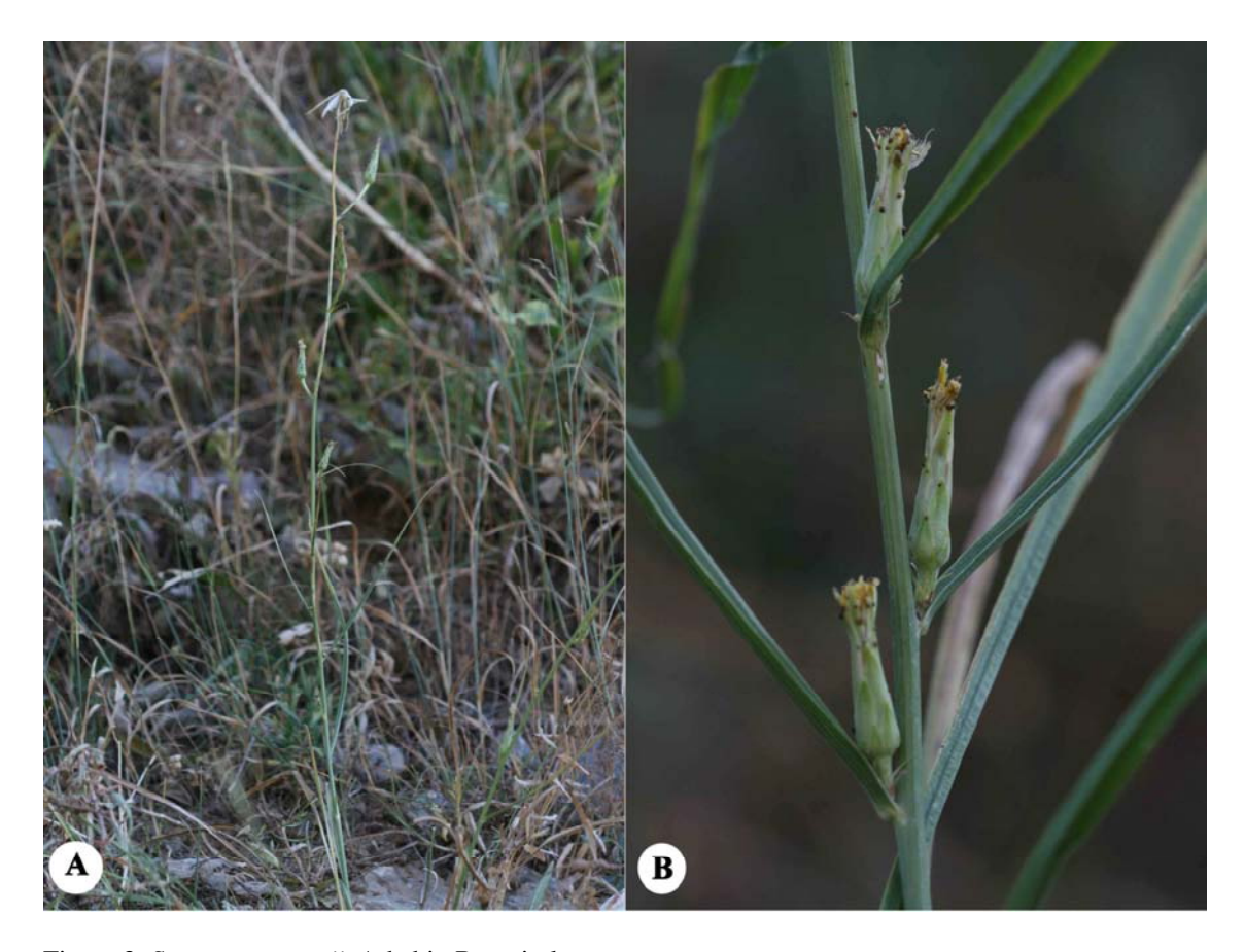
Figure 3. Scorzonera renzii. A-habit, B-capitula.