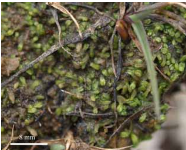
Figure 2. General view of R. canaliculata .

R. canaliculata can be easily recognized by the narrow chambered thalli with the apex of the branches distinctly narrowed and covered by the apical ventral scale and by the shape of the half-scales.