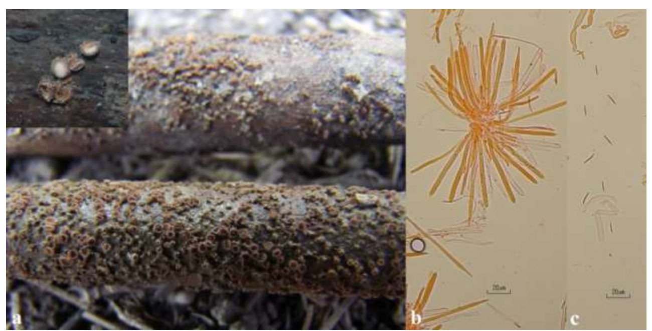
Figure 3. Lasiobelonium horridulum var. capitatum: a. ascocarps, b. asci and paraphyses, c. ascospores

Macroscopic and microscopic features: Apothecia 0.3-0.5 mm in diameter, sessile, based on a narrow receptacle. Cup light brown, decorated with subconcolorous paler hairs (Figure 3a). Hymenium beige, smooth. Asci 65-80 \times 5.5-7 \mu m , cylindrical (Figure 3b). Paraphyses lanceolate, septate. Ascospores 10-15 \times 1.7-2.3 \mu m , cylindrical fusiform, straight or slightly curved (Figure 3c), sometimes with small droplets at the poles. Hairs 120-160 \times 4-6 \mu m , cylindrical, multiseptate, thick walled, brown except 1-3 discolored, hyaline cells at the top.