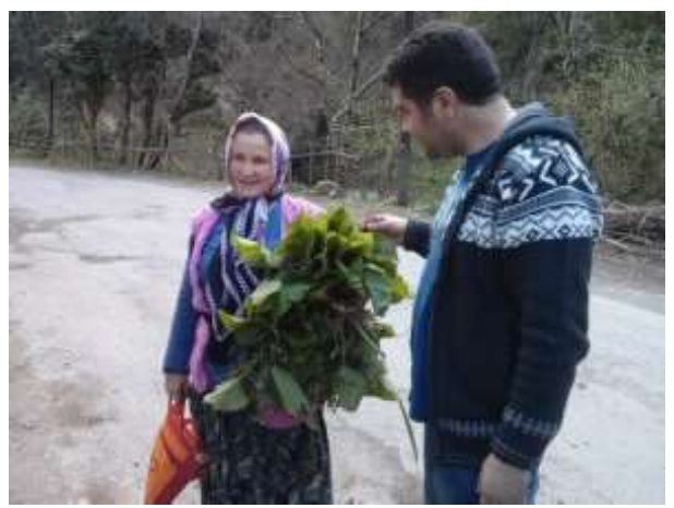
Figure 3. Field visits

Special attention was paid to conduct the field trips together with the villagers also by joining the village trips on most of the field visits (Figure 3). It was seen that such a planning of trips yielded more efficient results. Herbs shown by the resource people interviewed were collected both from markets and their natural habitats. Plants were collected from Avluca, Bahçecik and Güneyköy villages. Plants species in the flowering, fruiting stages or both were collected for identification. Collection started from late March till late November 2013. The identified specimens have been placed in the Herbarium of the Arts and Science Faculty, Giresun University.