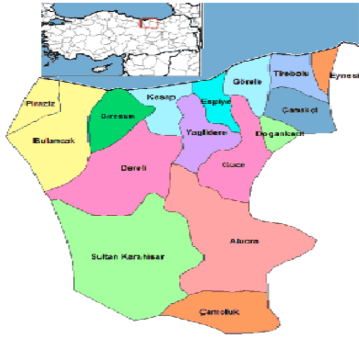
Figure 1. Resarch area

The territories of Espiye (Giresun) town are wholly situated in the Eastern Black Sea Region (costal and inner parts); surrounded by the Tirebolu and Güce in the east. Alucra town in the South, Keşap and Yağlıdere in the west and by Black Sea in the North (Figure 1). It is surface are 160 km<sup>2</sup>, and the population is 31.810 according to the of 2012 general census. The district consists of 30 villages.