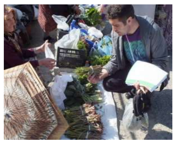
Figure 2. Local markets

Local weekly markets in the region are set in Espiye and around in the neighboring areas were visited (Figure 2). The villages and their products have been defined in these markets. The herbalists in the markets were also visited.